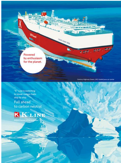
【An LNG-fueled pure car, truck carrier】