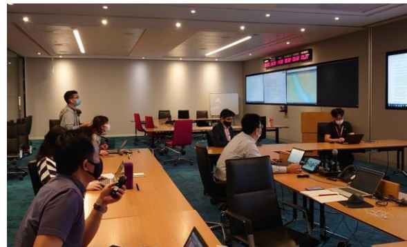
ONE headquarters in Singapore