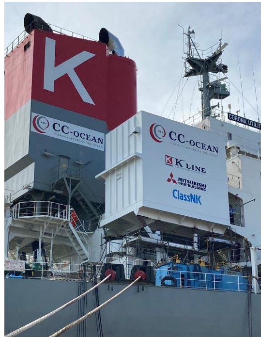
4. Installing on vessel ②