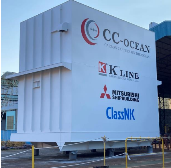
1. Before installation