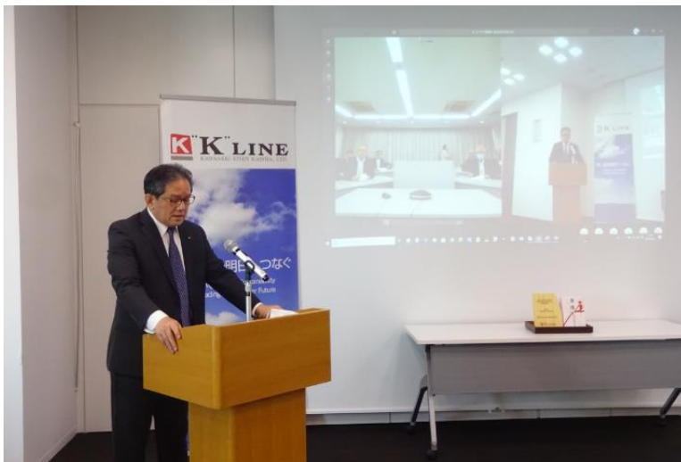
Web presentation by Grand award (Seagate Cooperation)