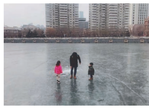
Hai River frozen in winter

located along the Hai River. A street called Jiefang Beilu running along the river used to be the center of economy and finance in Northern China when there were foreign concessions in Tianjin. Therefore, there are many different remnants from those times built in different foreign architectural styles, such as the German Club, the British Club, and the Tianjin office of Yokohama Specie Bank. The street is very appealing if you like colonial styles. When I started to work in Tianjin, I was surprised to find the preserved concession architecture still in use here and there.