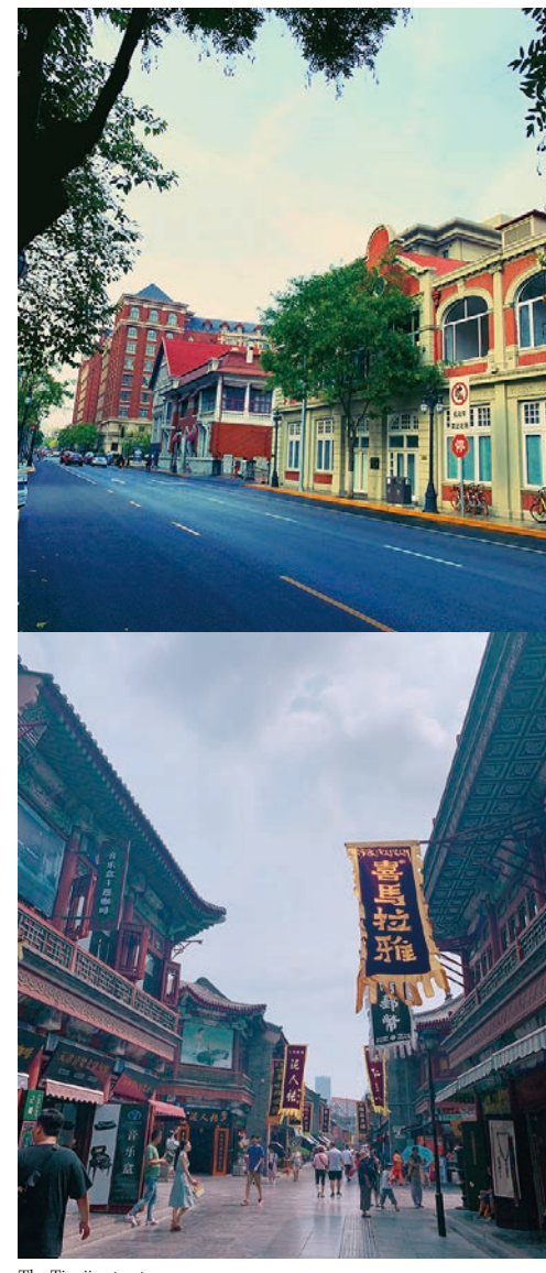
The Tianjin streetscape