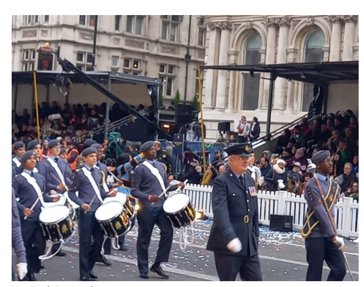
New Year's Day Parade