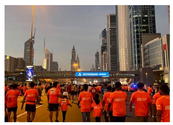
Dubai Run participants (They look like they are walking rather than running.).