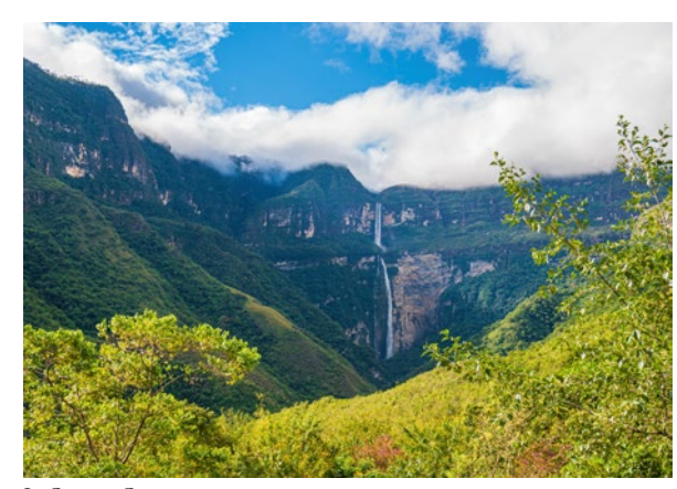
La Catarata Gocta

The Peruvian Amazonas is waiting for you. Make sure to come and visit!