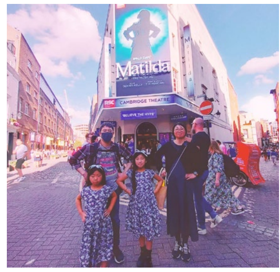
Matilda the musical

My family tells me the city has many more charms. You must come to London.