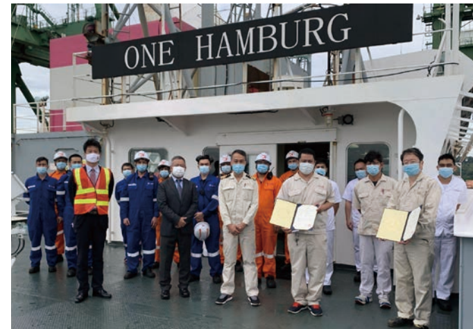
Certificate presentation ceremony on the accredited ship

K-ENE and the Very Large Crude Carrier (VLCC) "SETAGAWA" managed by K-ENE acquired CSMS accreditation from Class NK on September 24, 2020, and the certificate presentation ceremony was held on October 2 of the same year. K-ENE began preparations for cyber security in the summer of 2019, but as there were few companies in the shipping industry at the time that possessed knowledge related to cyber security for ships, ABS, a maritime classification society, was appointed as a consultant as they possess ship-level cyber security knowledge that corresponds with Tanker Management and Self-Assessment (TMSA) introduced by the Oil Companies International Marine Forum (OCIMF). We were advised by ABS on the necessary responses by comparing required cyber security measures and the current state of our ship and company. A consultant based in India was appointed to examine the ship and create a network diagram. While these preparations were advancing, we experienced the effects of COVID-19 and struggled, unable to move forward as planned, but we continued forward with preparations based on Class NK's CSMS guidelines and acquired CSMS accreditation through remote evaluation.