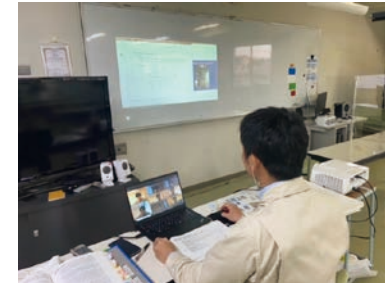
"K" Line Training Center (Machida)

* SIGTTO Standard Training Course: An international standard for LNG vessel crew training determined by members of the Society of International Gas Tanker and Operators