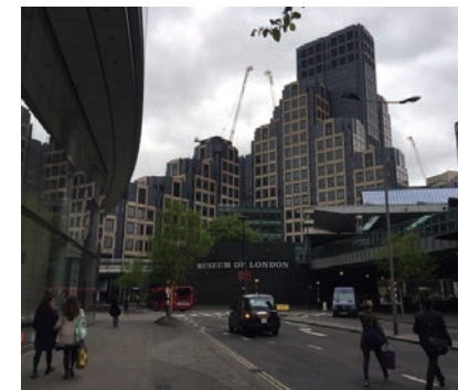
Museum of London and the company building

London is a place where people looking for work from around Europe gather, and as such, the workplace is multinational. The company is made up of staff from around fifteen countries. Because we are all from vastly different upbringings, there are great differences in how we view things and how we think. As a result, it is essential that we create an environment that brings everyone together to move forward by discussing and deciding on shared goals and milestones while respecting each person's character and diversity. For this reason, we at KLNG use KARE project, which is a concept and a thought system, concentrating our efforts on not only technical skills but also in the education, improvement, and use of non-technical skills so that we can effectively manage our technical skills. The word KARE is a combination of "care" and the K from "K" LINE.