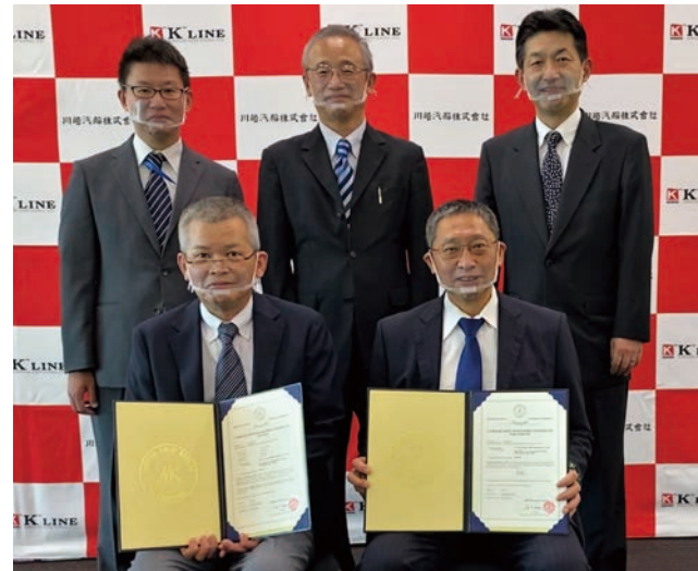
Certificate Presentation Ceremony (Second Row)

The resolution of "MSC.428(98): Maritime cyber risk management in safety management systems" was passed at the IMO Maritime Safety Committee which was held in June 2017. It is recommended that appropriate actions be taken for cyber risks through a safety management system by the first annual audit of a "Document of Compliance (DOC)" after January 1, 2021.