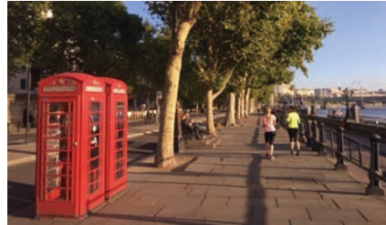
Promenade along the River Thames