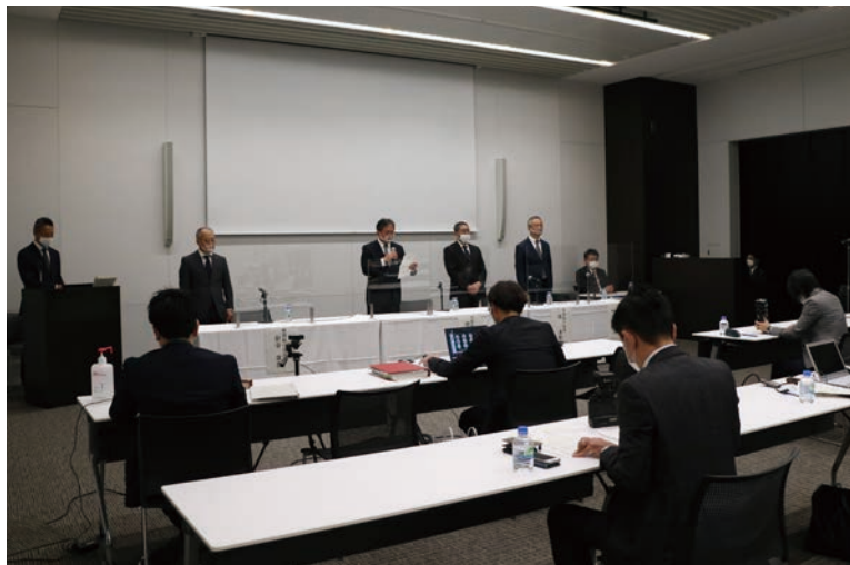
Mock press conference

Finally, we would like to express our appreciation for each and everyone who participated and helped with this drill.