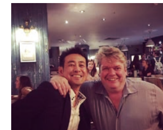
Chatting over drinks

British people love beer, of course, but they also love to use the word Cheers! But it is used daily to mean something other than offering a toast. It is frequently used to mean, "thanks". For example, we say, "Cheers," when someone does something for us at work, and both customer and employee say it when the customer pays for a beer at a pub.