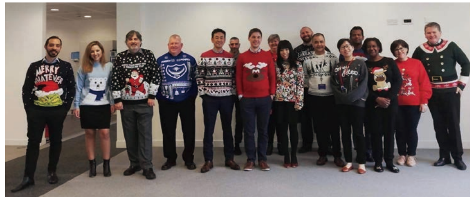
Office staff (author, five from right)

It has been three and a half years since I came to London, and the time has flown by when I think about it. From April 9, 2017 I flew to London on a 12-hour flight. Contrary to my expectations that this would be the perfect start as the weather was quite favorable, the jetlag was rough, and it took two weeks for the lightheadedness to go away and my body to return to normal, but my expectations towards my new life in London and my motivation towards my new job surpassed my discomfort.