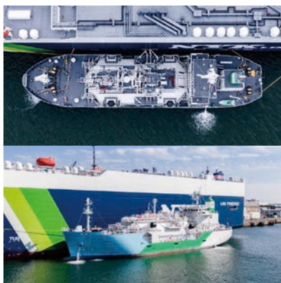
Kaguya supplying LNG fuel with ship-to-ship bunkering basis

Since April 1, 2020, one employee from "K" Line has been dispatched to the