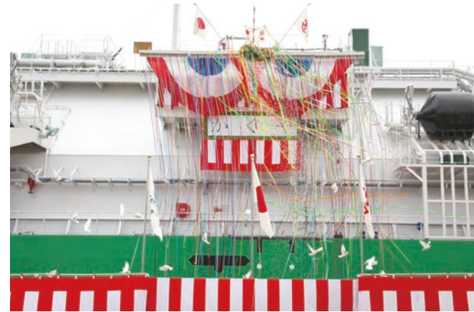
The vessel being named as, “Kaguya”

As a shareholder of the joint venture, the Fuel Supply and Procurement Group is committed to actively support the sale of LNG fuel and encourage the expansion of the use of LNG as marine fuel. We would once again thank you very much for all your continuous support.