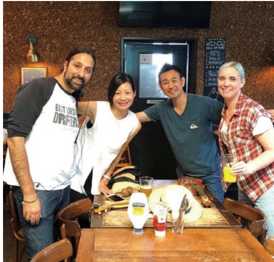
Former pop singer and wife (author and his wife, center)

There is also Ukulele Wednesday. Ukulele lovers gather every Wednesday in many places in London and play together. We play together with men and women, both young and old, and it takes no time to become friends with these people. I participated and sang in a charity concert at Waterloo Station during the Christmas Season last year. Open mic sessions are also all the rage in London, and anyone can casually perform in public at pubs. I sometimes have sung along with my ukulele. When the audience is really engaged, they sing along with me and get into the spirit. I have also encountered a variety of young artists and audience members from various countries.