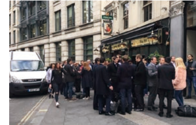
Lively scene outside a pub

There are Eight Behaviors in the KARE project: 1. Care, 2. Mutual trust, 3. Team building, 4. Dilemma management, 5. Speaking up, 6. Feedback, 7. Learning, and 8. Open actions. Being aware of these, we respect, encourage, and care for one another while creating an environment where we can speak without regard to position and placing value on communication. Creating teamwork that can determine and respond appropriately in important situations and leadership in which each person acts with responsibility is important. This is not something that happens overnight, and this workplace environment may be one where everyone continues and acts with this in mind.