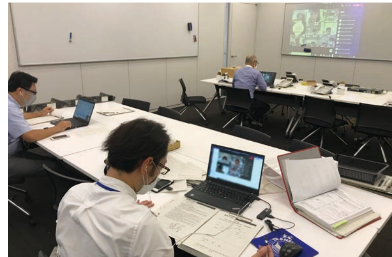
Mass media and public inquiry response