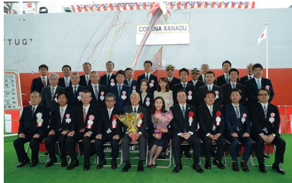
Thermal Coal Team No.1 Thermal Coal Group