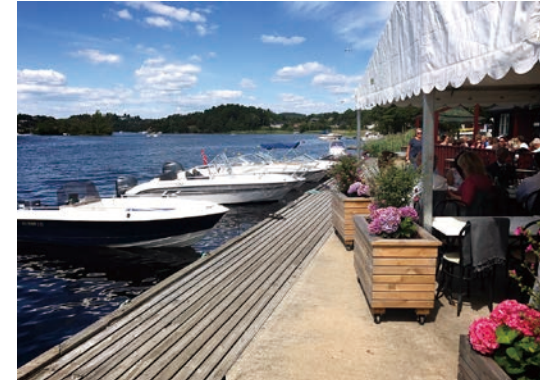
A restaurant enjoyed by mooring a boat alongside

As you may expect, boats are an indispensable part of summer in Arendal. The idea may seem like a dream for Japanese people, but it is common for people in Arendal to own a boat for personal use. Many local people start servicing their respective boats with the arrival of spring and they set out to sea on their boats on days blessed with good weather. They admire from the ocean the beautiful wooden houses in various colors, and enjoy sailing their boats through geographical features peculiar to Norway, such as small fjords and islands, at a leisurely pace. Afterwards, they anchor at seafront restaurants where they devour fish and shellfish, such as shrimps and blue mussels caught in local waters, with white wine. Sometimes they enjoy barbecuing fresh seafood and meat on a large grill that each family in Norway owns as a matter of course. This is how people spend summer, the most wonderful season in Norway.