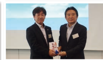
Nitto Total Logistics Ltd.

To achieve the goals set out in the “K” Line Environmental Vision 2050, all directors, employees and crew members of oceangoing vessels working in the “K” Line Group must retain a sincere commitment to activities to protect the environment in their everyday life. This year, all applicable Group companies in Japan will begin taking part in a comprehensive environmental management network for the “K” Line Group launched last year called The DRIVE GREEN NETWORK (DGN). Let’s continue our efforts to share the environmental preservation activities of each other widely, extend them as Group-wide initiatives, and link them to improvements in levels through the “K” Line Group Environmental Awards.