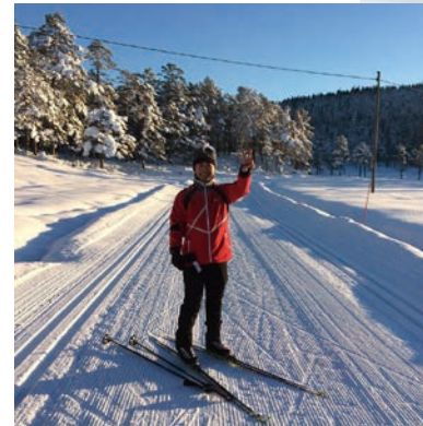
I began cross-country skiing myself.

There are just eight Japanese people living in Arendal. They include six related to Kawasaki Kisen Kaisha, Ltd. (hereinafter referred to as "K" Line), including four who are my family, and two women married to Norwegians. Unfortunately, there is no Japanese grocery or Japanese restaurant here in this environment, my family and I are living in a way that is entirely blended into the local community. I spend a typical day here in the ways described below. I want to invite you all to visit Arendal regardless of seasons. Here in Arendal, you can count on finding some wonderful nature and enjoying some precious experiences not available in Japan. We will give you a hearty welcome.