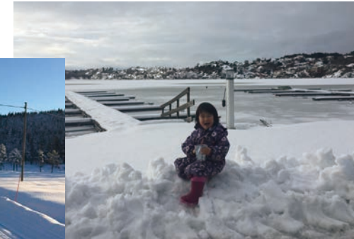
The sea also freezes over in winter.