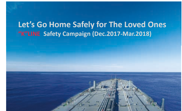
A Poster for the Fiscal 2017 "K" Line Safety Campaign

Finally, "K" Line would like to once again express its deep and sincere appreciation for all the crew members, board members and employees who took time to cooperate with the campaign this fiscal year.